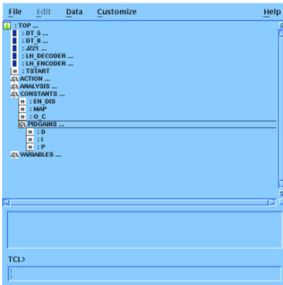
Figure 5.3: CONSTANTS child.

values, each having the value 0 or 1. 0 means that the system is running in open loop, 1 that it is closed loop. The sub-child PIDGAINS contains 3 numeric nodes D (derivative), I (integral) and P (proportional). Each of those contains an array of 24 values.