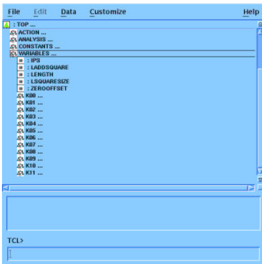
Figure 5.4: Overview of the VARIABLES child.