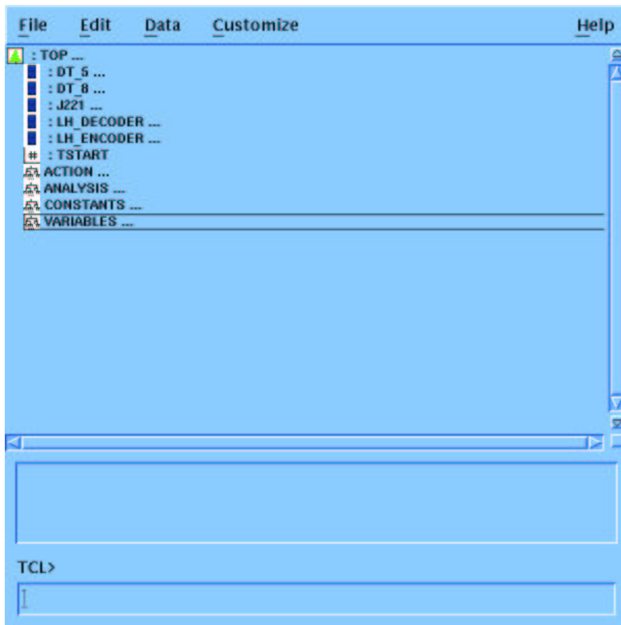
Figure 5.1: Overview of the LH tree.