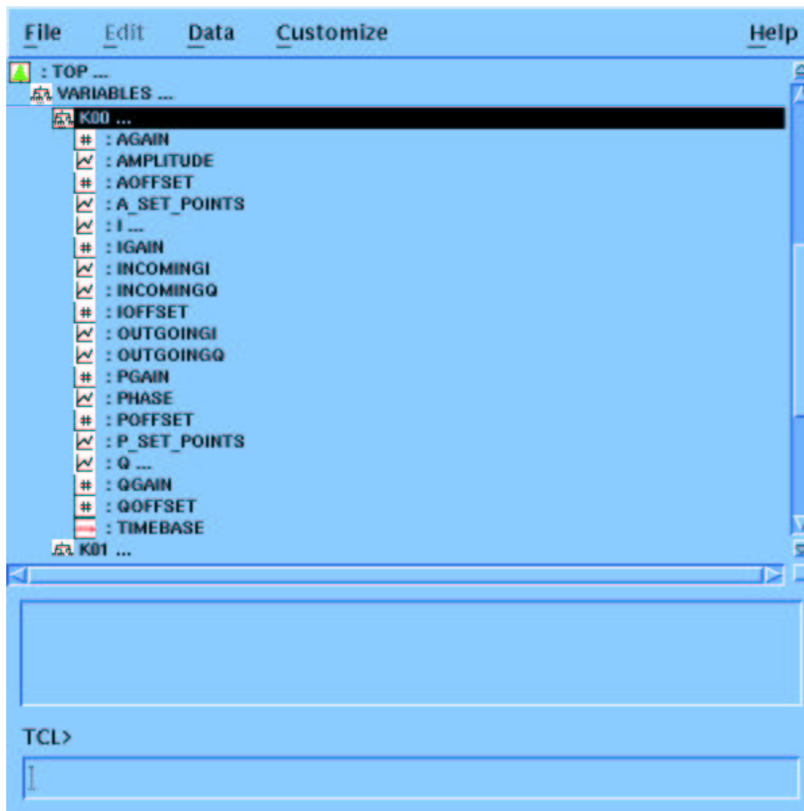
Figure 5.5: VARIABLES child for the first klystron (K00). The other 11 entries (K01...K11) are identical in structure.